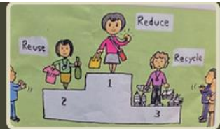
Waste not .....